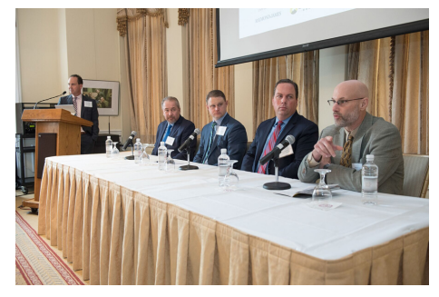
The Lenders Panel Discussed Best Practices and Lessons Learned While Using USDA's Loan Programs